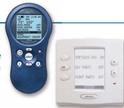
Jandy Aqualink Controller

If you want the very best in pool automation then combine your TRi with a Jandy Aqualink controller. This combination gives you control over all your pool care products including cleaners, filtration, lighting, water features and more. To learn more talk to your local pool care professional or call us at Zodiac Group Australia on 1800 688 552 or visit our website www.zodiac.com.au